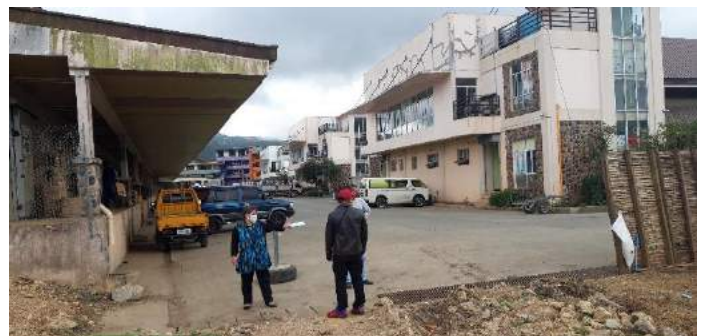
Current soil present: Backfill and garbage