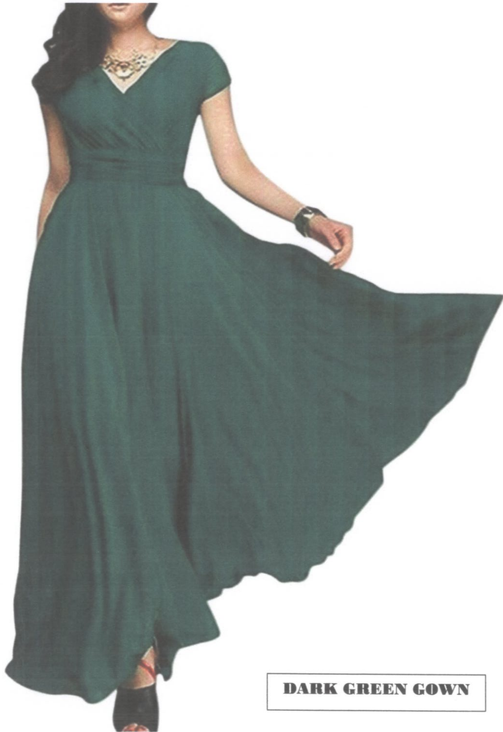
DARK GREEN GOWN