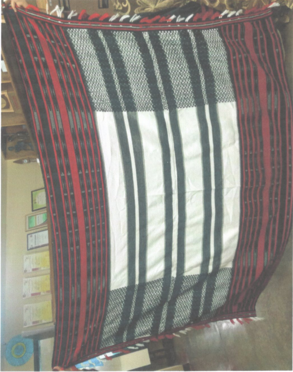
Benguet Blanket (male)