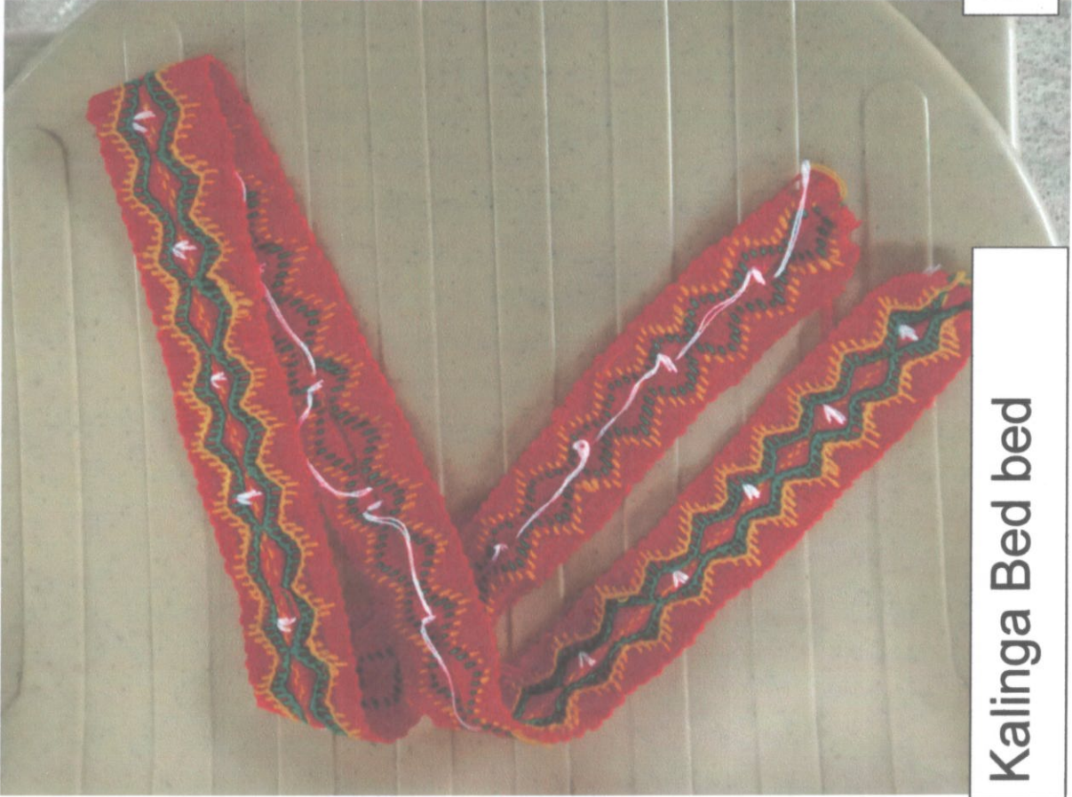
Kalinga Bed bed