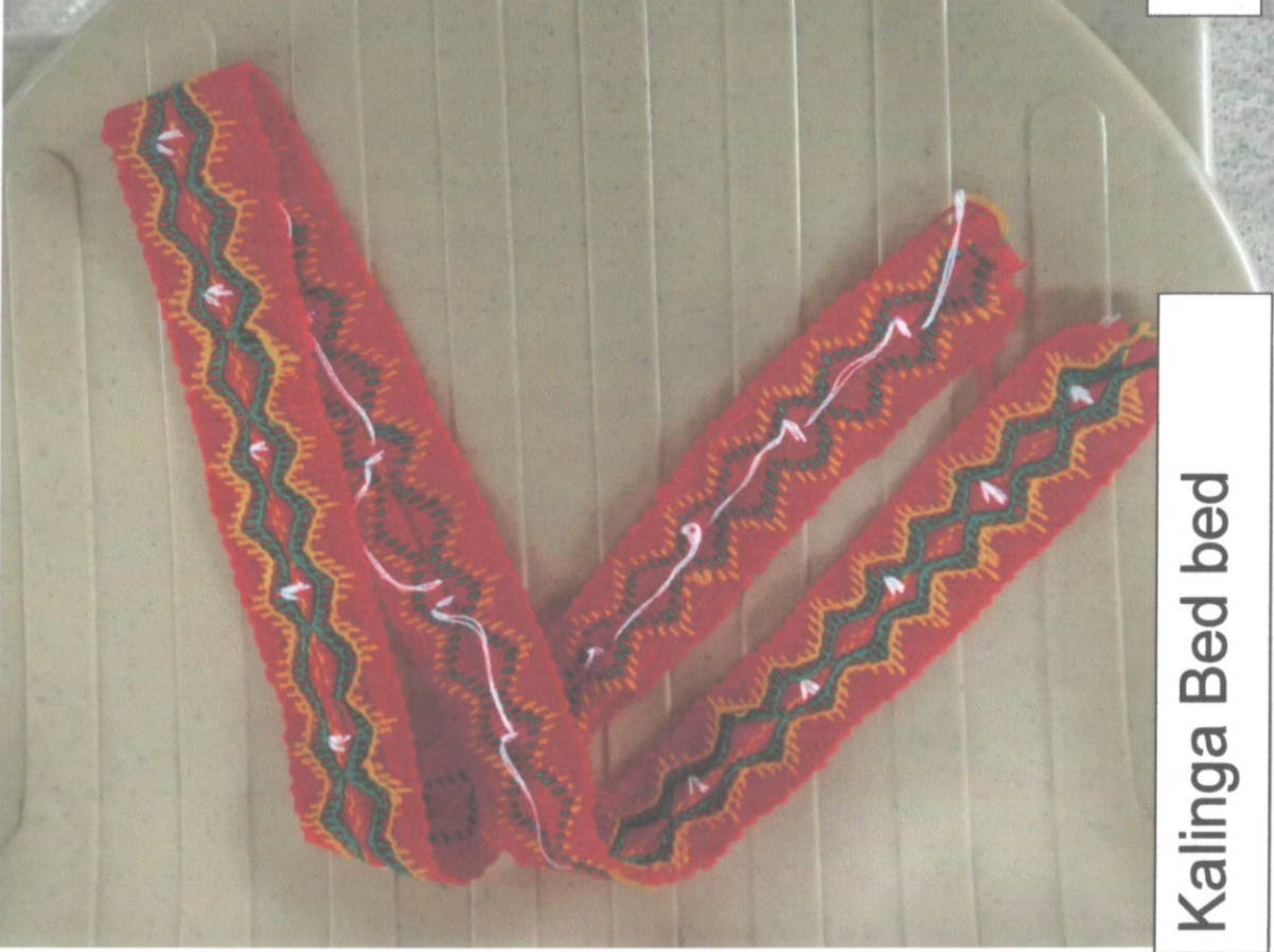
Kalinga Bed bed