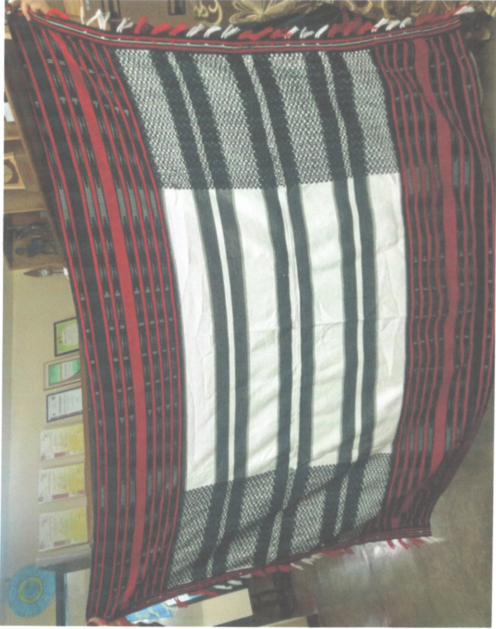
Benguet Blanket (male)