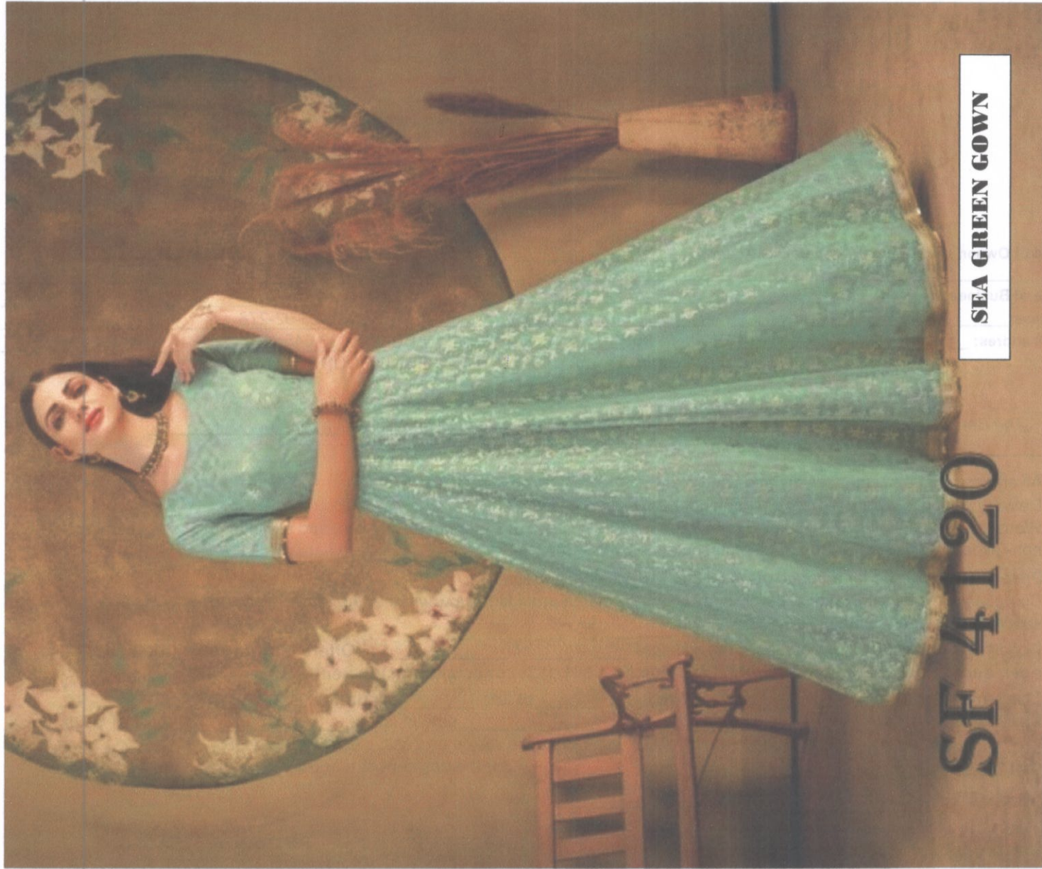
SEA GREEN GOWN