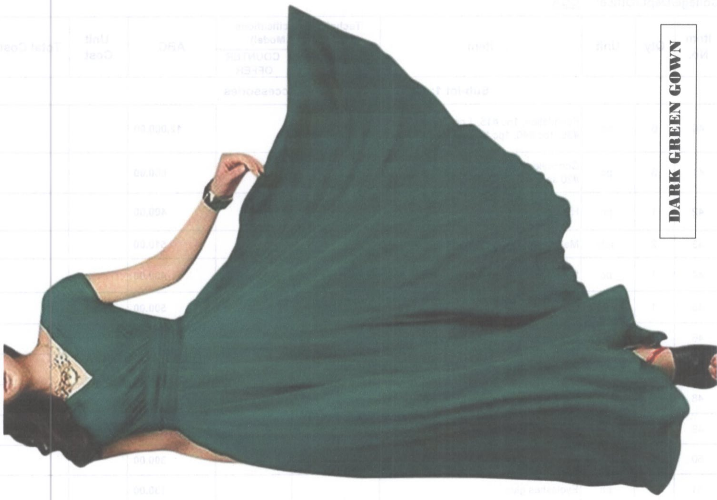
DARK GREEN GOWN