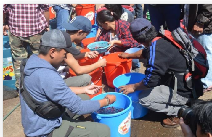
Hands-on training on Enhanced Postharvest Processing for Arabica Coffee and Coffee Cupping conducted by Institute of Highland Farming Systems and Agroforestry held on February 19-20, 2019 at Bektey, Puguís, La Trinidad