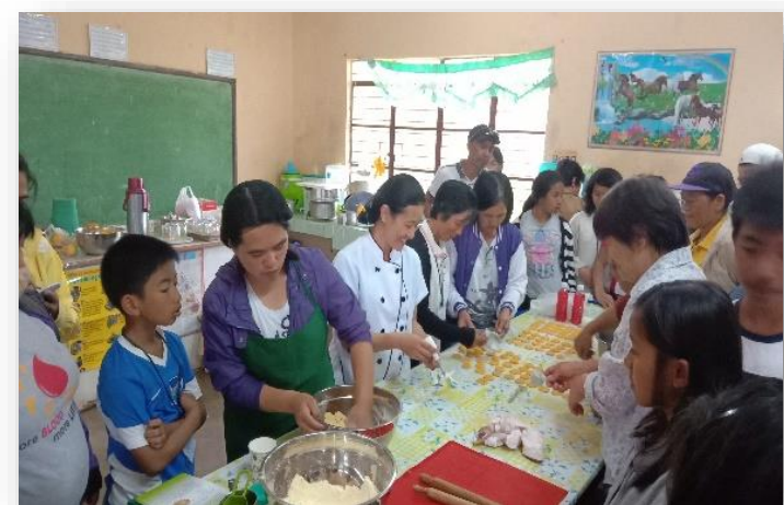
Hands-on demo on processing of sweetpotato and legume based food products (SP Puto, Camote -lemon juice, Pigeon Pea Cookies, Legume Crackers) conducted by NPRCRTC held on March 28, 2019