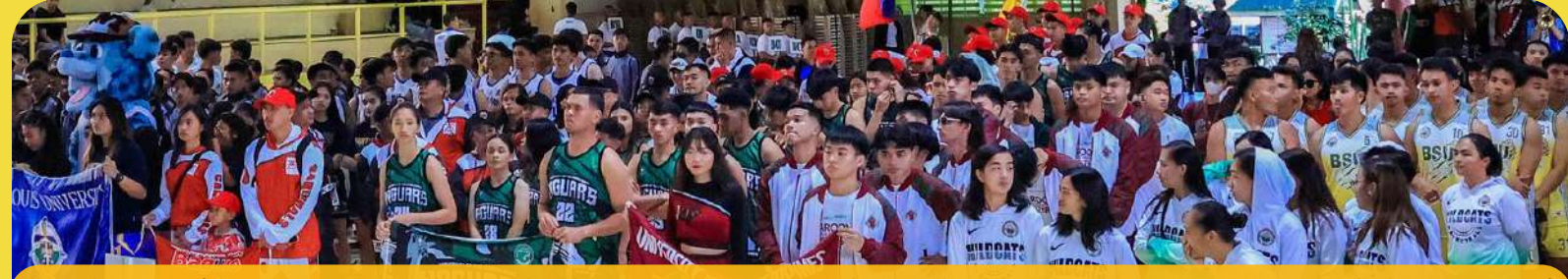
The 34th season of the Baguio-Benguet Educational Athletic League (BBEAL) opened on October 28, 2023 at Benguet State University, the host institution for this season. Student-athletes, coaches, and sports fans from several schools in Baguio and Benguet come together for this event.

BSU recognized at 2nd ICONS Awards 2023... from page 1