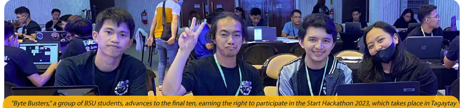
"Byte Busters," a group of BSU students, advances to the final ten, earning the right to participate in the Start Hackathon 2023, which takes place in Tagaytay from October 17–19. The Byte Busters' submission is chosen from 75 entries submitted by professionals and students around the country.

issues and challenges faced by the LGUs, towards smart city development. This was organized by the Development Academy of the Philippines (DAP) -Center for Strategic Futures under their Linking Innovation Partners Towards Accelerated Development in the Philippines (LIPAD) program.//JSTabangcura