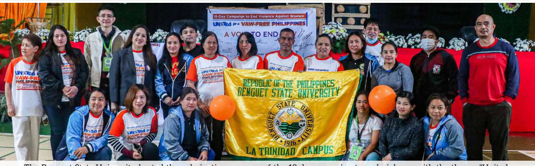
The Benguet State University hosted the culminating program of the 18-day campaign to end violence with the theme, "United for a VAW-Free Philippines" by Regional Gender and Development Committee. Different government units and agencies from the Cordillera like the La Trinidad Police Office, Regional Development Council, Commission on Population, Barangays Ambiong, Balili, Poblacion, Puguis, Tawang, and Wangal, and Private Sector Representatives attended the activity.