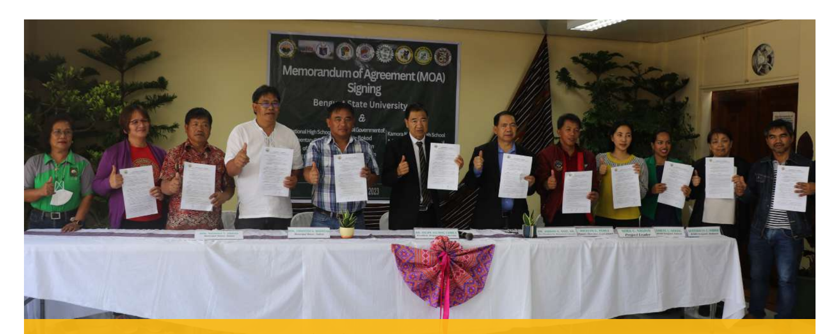
BSU enters a Memorandum of Agreement (MOA) with the Department of Education schools and the Municipal Local GovernmentUnits (MLGUs) of Benguet and Mountain Province to address the issue of continuous degradation of watersheds and the environment. The partner schools are Tapapan Elementary School, Tadian School of Arts and Trades, Tipunan National High School (NHS), Lubon NHS, Pingad NHS, and Sabangan NHS in Mountain Province, while in Benguet are Kamora NHS, Adaoay NHS, Daclan NHS, Ambangeg NHS, Balili NHS, and Mankayan NHS. The partner MLGUs include Bokod, Kabayan, and Mankayan in Benguet, while Tadian, Bauko, and Sabangan are partner MLGUs in Mountain Province. The MOA signing with DepEd schools and MLGUs was held on June 23 and 26, respectively, at BSU.