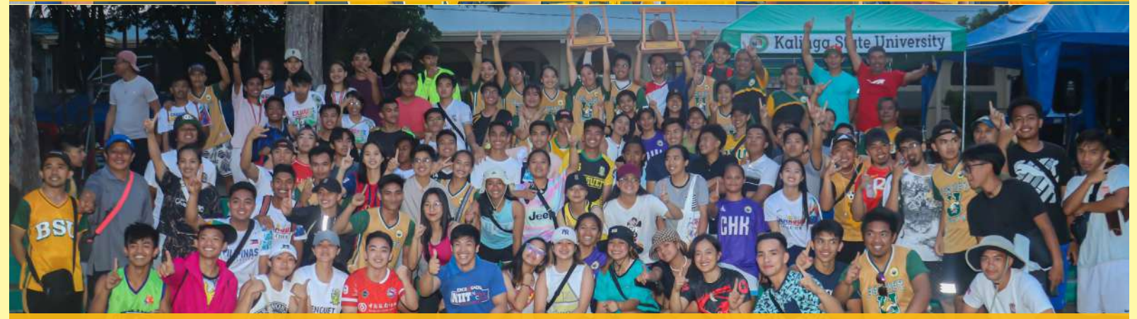
Exultant BSU athletes, coaches, and participants revel in their triumph as they celebrate their hard-fought victory after the closing program of the CARASUC 2023 Athletic meet and Culture and the Arts competition at Kalinga State University, Tabuk City, Kalinga on April 21, 2023.