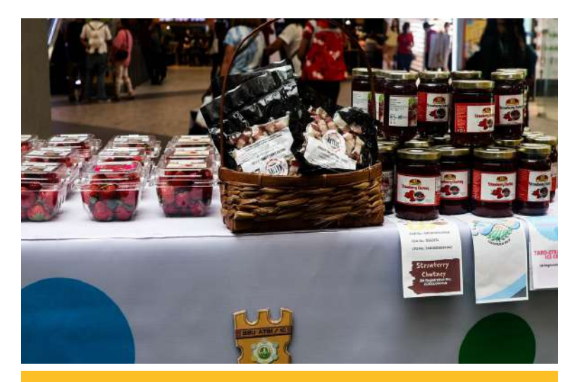
BSU ATBI/IC displays strawberry products and dried meat products at SM Baguio City during Agri-Aqua Incubatee Summit Trade Fair on April 22-23, 2023.

Through an exhibit and trade fair, the summit displayed the products developed by the incubatees