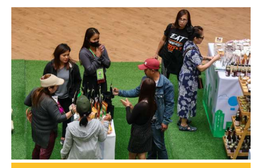
BSU ATBI/IC takes center stage at SM Baguio City, captivating mall goers with an informative engagement at the Agri-Aqua Incubatee Summit Trade Fair, showcasing the diverse range of products.

using their own or universities' technologies. Additionally, it encouraged connections and collaboration among incubatees, as well as between private and public organizations, in order to establish emerging enterprises // CANapiloy and FPDulas (BaComm Intern)