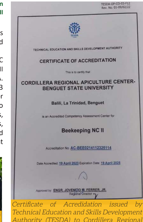
Technical Education and Skills Development Authority (TESDA) to Cordillera Regional Apiculture Center - BSU (CRAC) as an Accredited Competency Assessment Center for Beekeeping NC II.