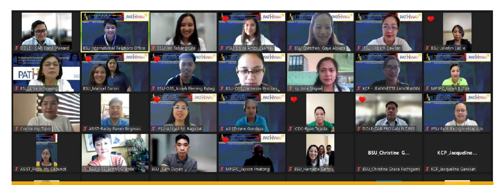
The Benguet State University PATHWAY team holds Phase 1 of the "Drawing PATHWAYs to Employability and Entrepreneurship through University-Enterprise Cooperation" training online on April 24 and 25, 2023.

Phase II of the training series, which will focus on entrepreneurship, will be held on May 25-26, 2023. The Continued on page 6