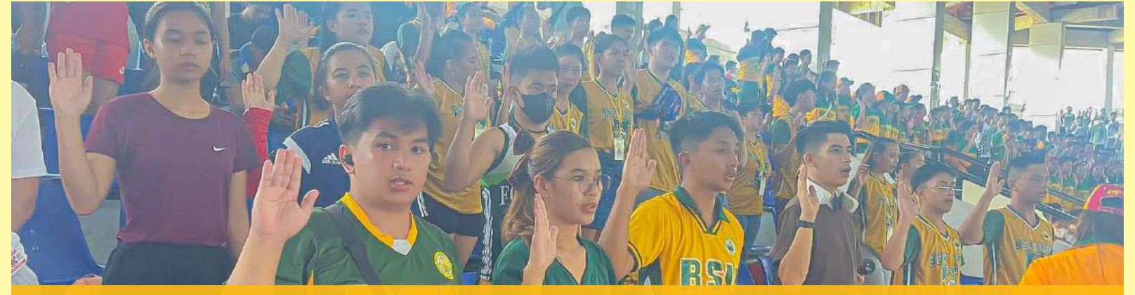
Athletes taking their oath of sportsmanship during the opening of the CARASUC 2023 Athletic Meet on April 18, 2023.

BSU's victory in the CARASUC 2023 twin events is a testament to the university's commitment to providing quality education and promoting holistic development among its students. The university's success in both the athletic and cultural arenas is a reflection of the institution's values and principles that focus on the development of the whole person.